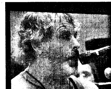
Bob Weir on stage Aug. 11 at the Mount Fuji Jazz Festival, and stage center (above) during a Grateful Dead concert in New York in March 1991